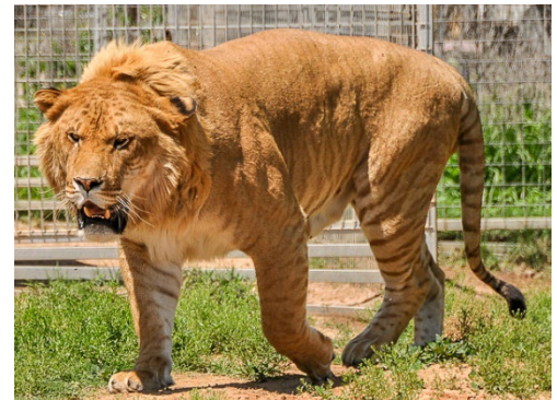
The image shown is a liger.

Did You Know: When a male tiger and female lion mate they make a tigon, when a male lion and female tiger mate they make a liger.