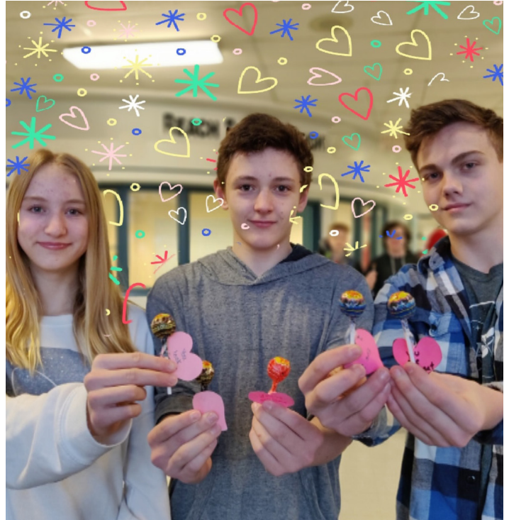
Leadership 9 Students Spreading the Love

In honour of our kindness-themed month of February, Cougar Tracks has turned pink! Whether it be Valentine's day sweetheart messages, morning high fives and treats, or just everyday kindness in our interactions, February has been a great month here at Sherwood Heights. Our students have been focusing on the many opportunities to show daily kindness to themselves and each other as part of Random Acts of Kindness week (Feb 17 - 23). The month culminates in our annual Pink Shirt Day (February 27th) where we collectively stand together against bullying in all forms and choose kindness. We encourage all students to participate. What a great month!