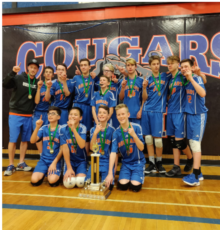
Another Banner Year for Sherwood Heights Volleyball

Tuesday marked the end of another banner year for Cougar Volleyball as the Junior Boys defeated F.R. Haythorne to take Gold in the EIPS playoffs. This marks back-to-back Championships for our Jr Boys teams. Our Sr Boys and Jr Girls volleyball teams also performed incredibly well, earning silver medals in the playoffs. Our developmental teams and Sr Girls also had strong seasons, with the Sr Girls narrowly missing the finals in five sets. Overall, an amazing year for our teams and definitely deserving of Cougar PRIDE! Many thanks to the amazing coaches, liaisons and parents who helped our athletes reach for the heights. On to basketball!